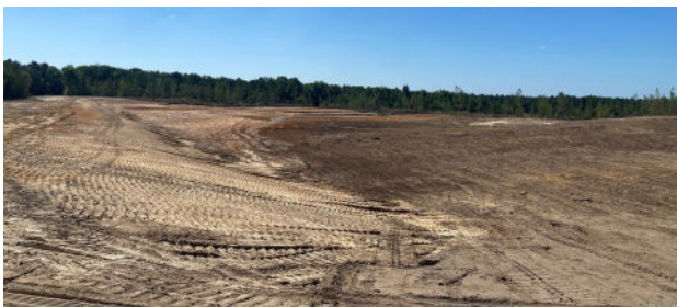
Iron Horse - After