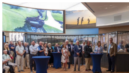
World Golf Hall of Fame

MCEDP hosted a record 160 members, guests, and elected officials at the May 22nd Moore 100 Members Meeting at the USGA Experience & World Golf Hall of Fame .