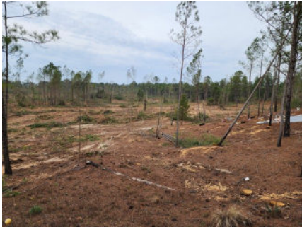
Iron Horse - Before