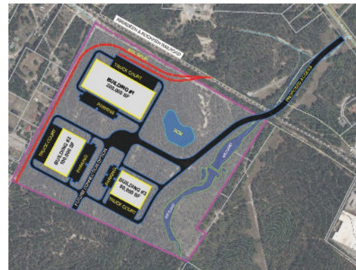
Conceptual Layout #2 — (3) smaller buildings

The next conceptual layout shows the option of constructing three (3) smaller buildings on the site of 80,000 square feet (SF), 100,000 SF, and 200,000 SF.