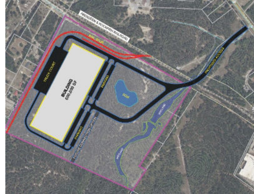
Conceptual Layout #1 — (1) large building

The following conceptual layout shows the option of locating one (1) larger 600,000 square-foot building on the site that can accommodate 1 tenant or be subdivided for multiple tenants.