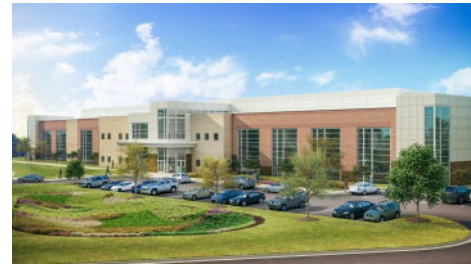
Early College Conceptual Rendering

ers who will have access to a continuous pipeline of skilled, job-ready workers.