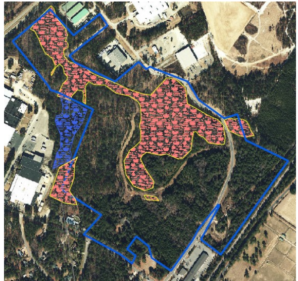
Area outlined in yellow shows approximate location of wetlands

This quarter, MCEDP staff obtained a cost estimate to complete a wetland survey for the Southern Pines Corporate Park based on the wetland delineation previously completed in 2022. The survey is required to complete the next step of obtaining a Jurisdictional Determination by the U.S. Army Corps of Engineers which determines if the wetlands require regulation under Section 404 of the Clean Water Act.